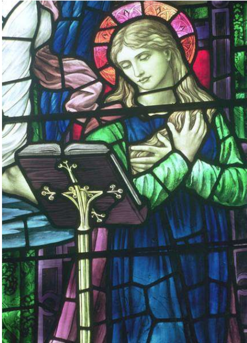
Figure reading from the Lectern